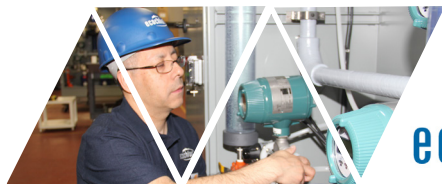
Ballast Water Management System