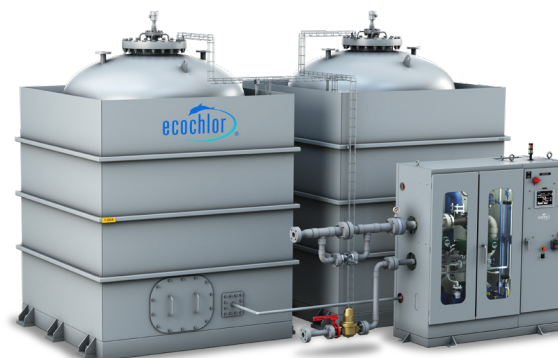
Ecochlor BWMS Generator, Chemical Storage Tankers and Treatment System Control Panel

Option for Series 75, 100, 150, 200, 250, 300