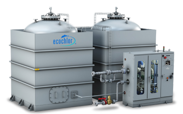
Ecochlor BWMS Generator, Chemical Storage Tankers and Treatment System Control Panel

Option for Series 75, 100, 150, 200, 250, 300